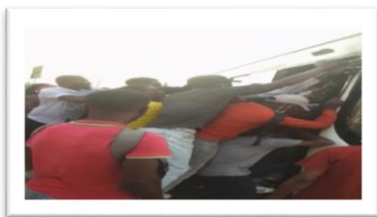
Fig. 1. Public transport in Luanda

The graph above shows how the current situation of covid-19 in Angola is, in which we can say that it is a good and controlled situation, according to the message of the President of the Republic "João Manuel Gonçalves Lourenço" in which the number of recovered is satisfactory and this creates a hope of its January 2022 we will not have more active cases and deaths because the objective is to vaccinate 60% of the population that is in Luanda "capital".