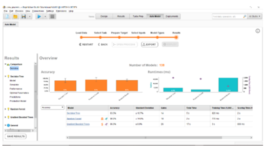
Fig. 4. Performance of each algorithm

Fig. 3. Gradient Boosted Tree Predictions